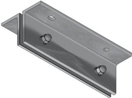
Fin Root Bracket